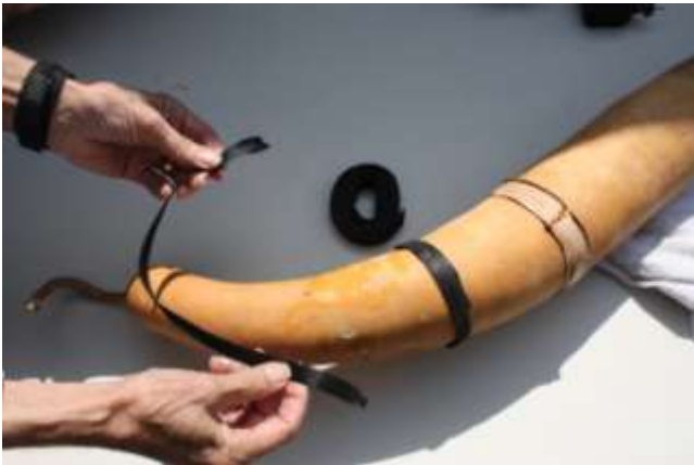
Velcro hook n loop strips

When you have an even bead of glue covering the surface of the cut edges, place the other half of the gourd on top matching up the two halves. Using the lines you marked at problem areas, adjust and ease these together and apply clamps or Velcro strips. Start at the center and work toward each end. Adjust bands or hose clamps as needed for an even fit. Allow glue to dry for 8 to 12 hours. Remove tape, clamps or Velcro strips and sand the sealed joint line smooth if needed.