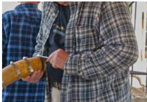
Dry fit the hose clamps